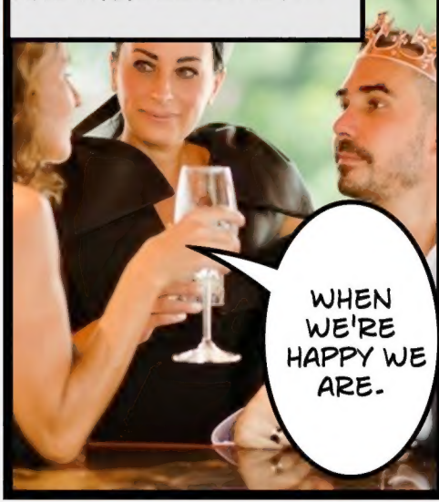
MEANWHILE AT ANOTHER LOCATION---